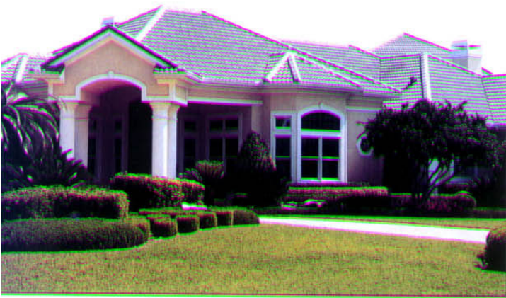
A typical home in the GlenEagles neighborhood, elevated from the street ...and from the taxiway.